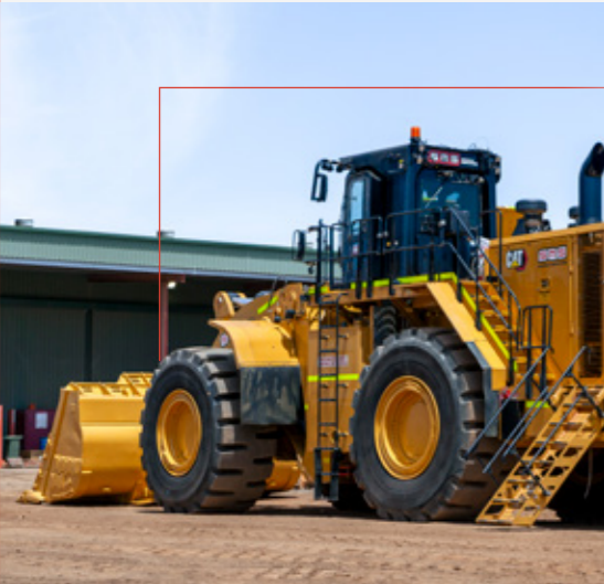
CATERPILLAR 992 WHEEL LOADER

The New D10 dozer is equipped with advanced antenna technology, making it Cat Terrain and remote control ready.