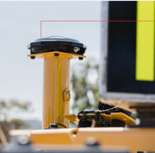
CATERPILLAR D10 DOZER

Our new Caterpillar trucks feature an enhanced payload capacity, boosting operational productivity.