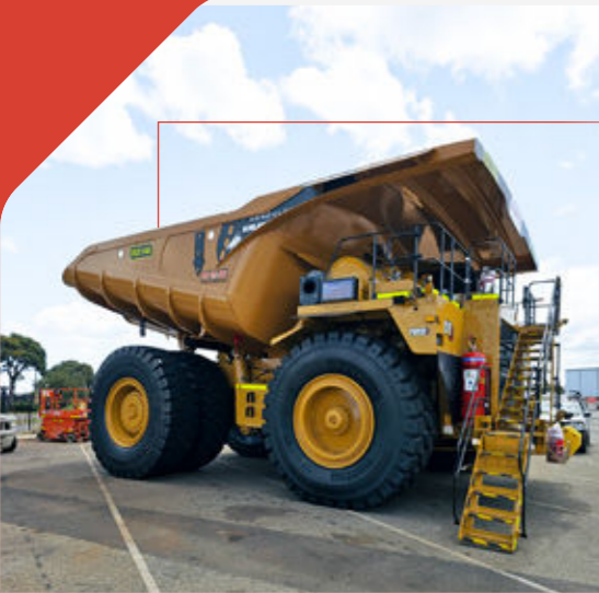
CATERPILLAR 785D DUMP TRUCK

We continue to invest heavily in innovation, systems and technology to support mine operation profitability, equipment reliability and control capital investment.