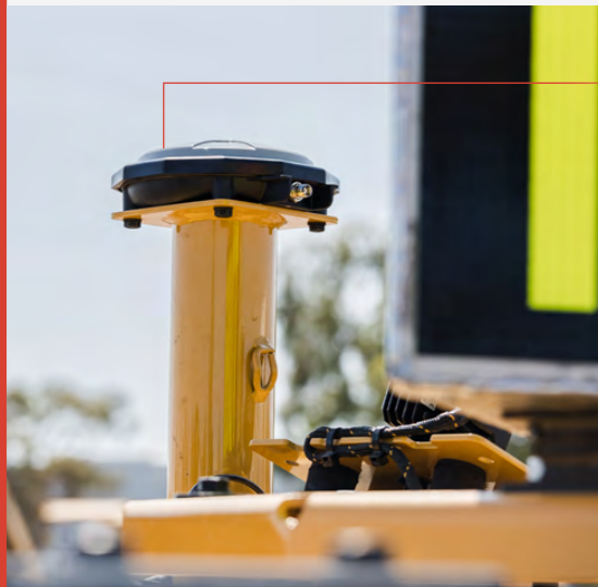
CATERPILLAR D10 DOZER

Our new Caterpillar trucks feature an enhanced payload capacity, boosting operational productivity.