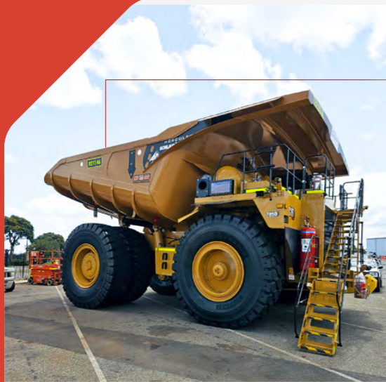
CATERPILLAR 785D DUMP TRUCK

We continue to invest heavily in innovation, systems and technology to support mine operation profitability, equipment reliability and control capital investment.