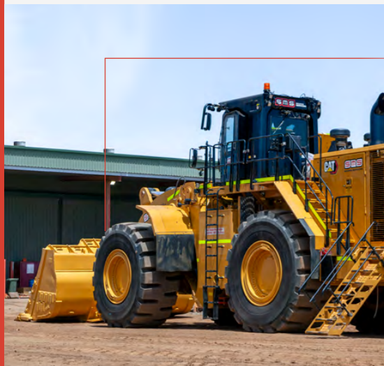
CATERPILLAR 992 WHEEL LOADER

The New D10 dozer is equipped with advanced antenna technology, making it Cat Terrain and remote control ready.